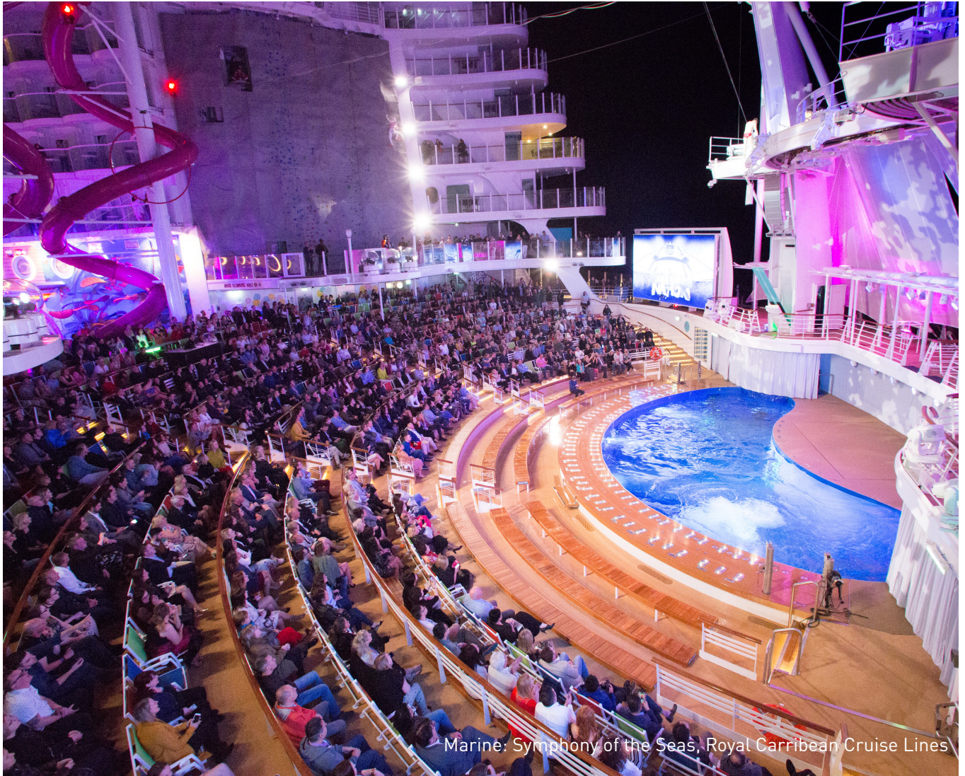
Marine: Symphony of the Seas, Royal Caribbean Cruise Lines

“ Harmony of the Seas is like a floating city, so we needed a lighting control solution that is simple to install and gives us all the capabilities we need on a project of this size and complexity.