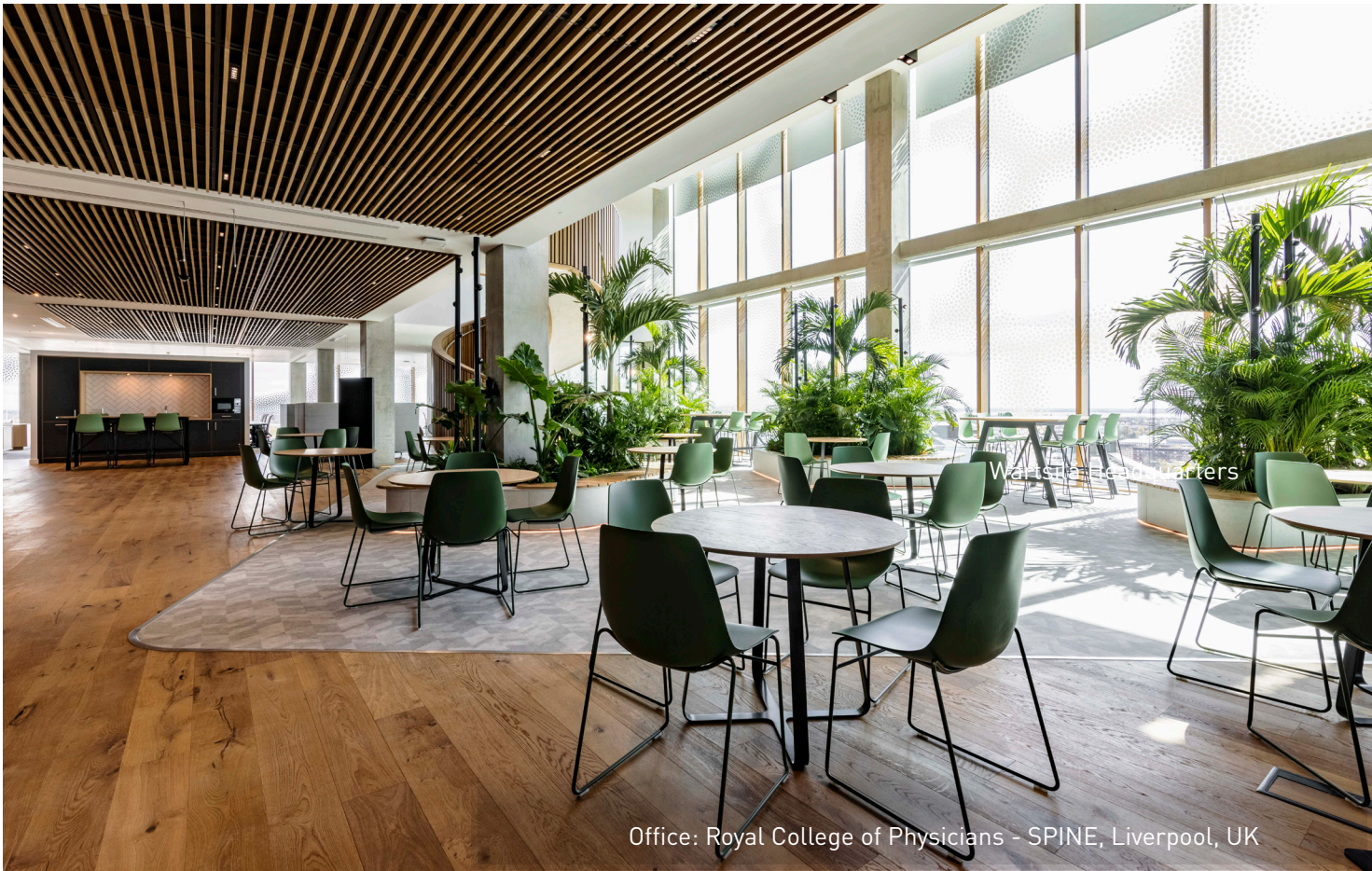
Office: Royal College of Physicians - SPINE, Liverpool, UK