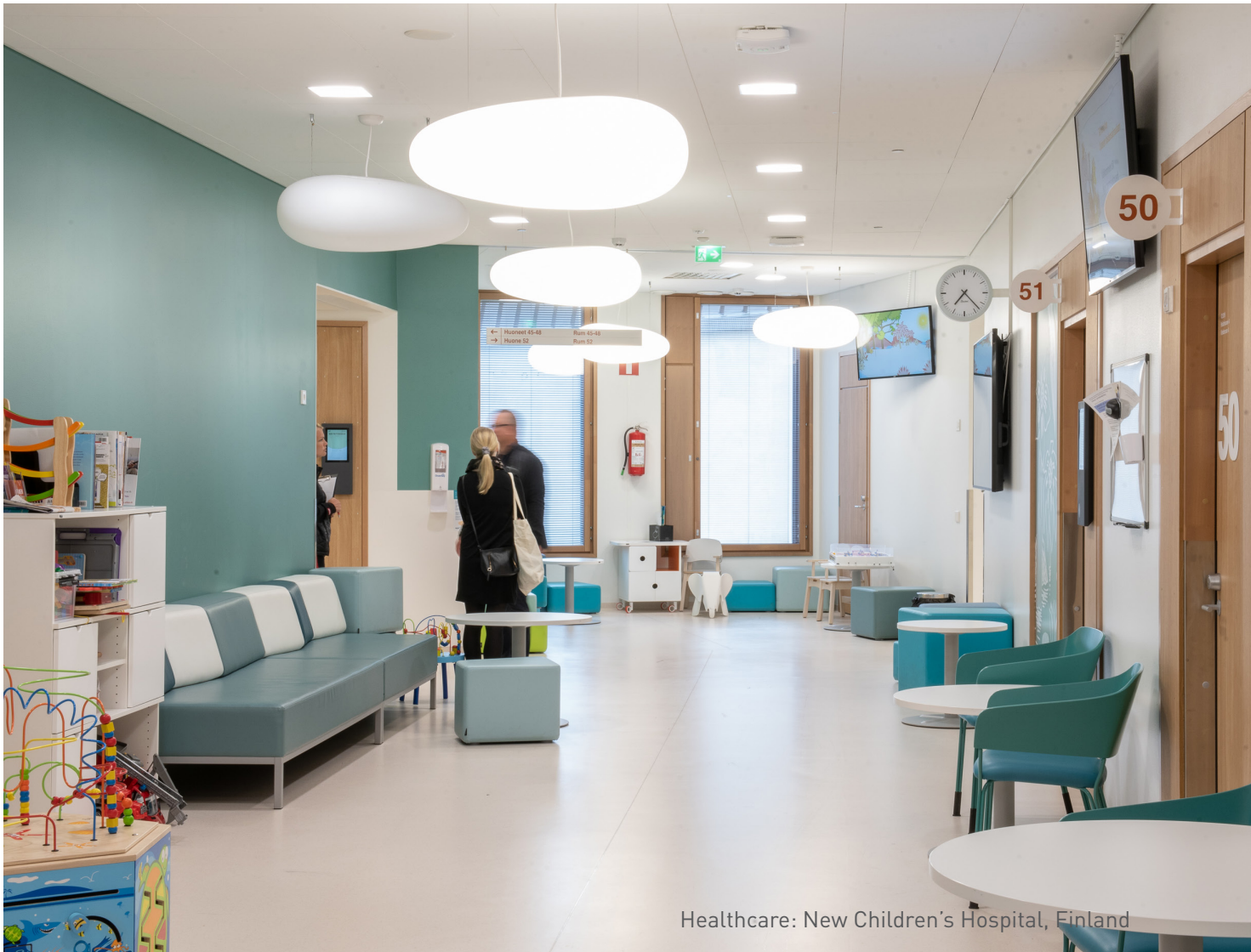
Healthcare: New Children's Hospital, Finland