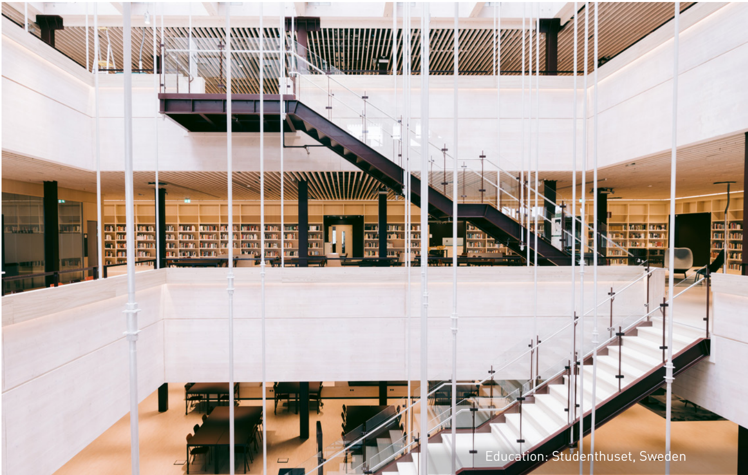
Education: Studenthuset, Sweden