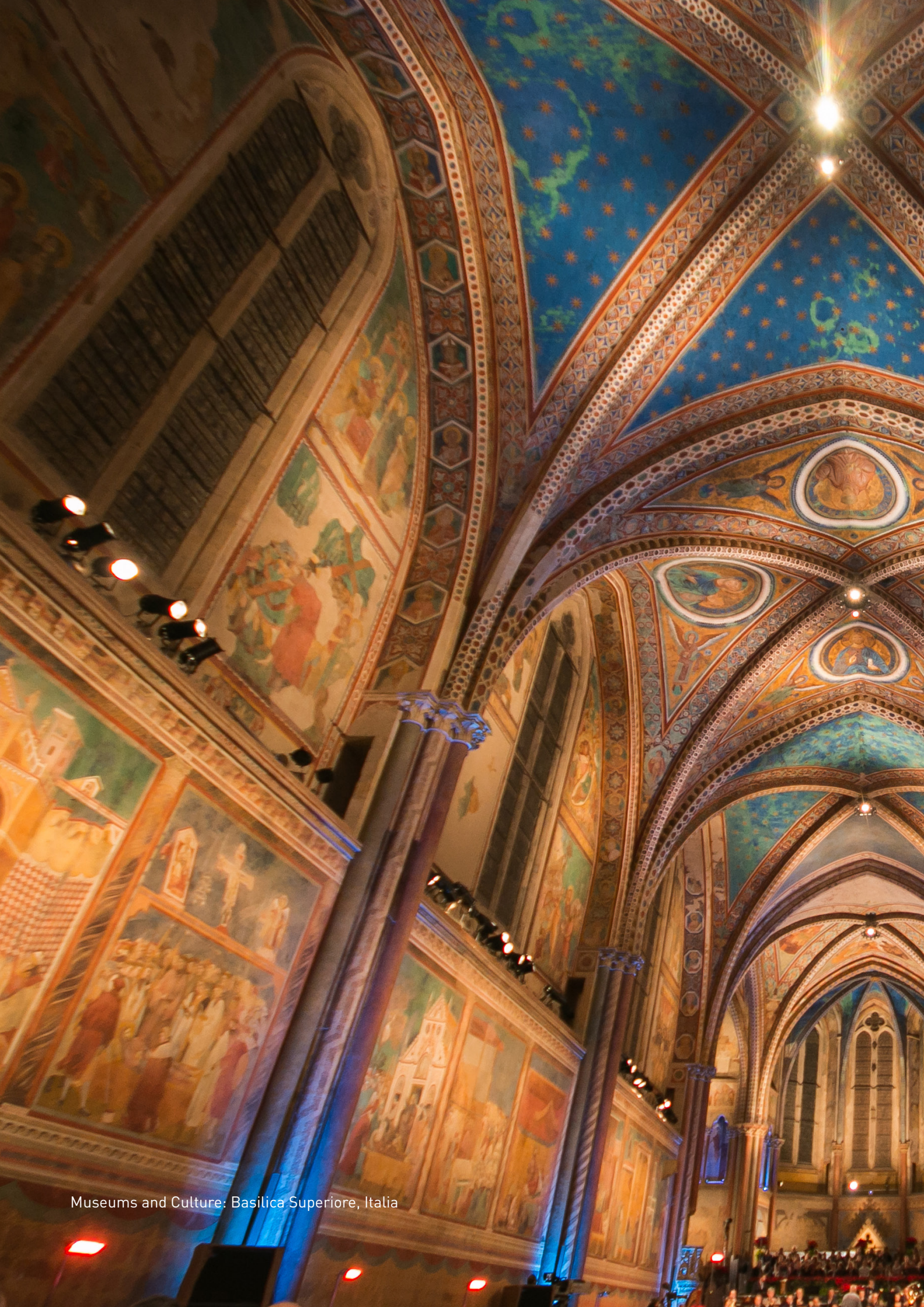
Museums and Culture: Basilica Superiore, Italia